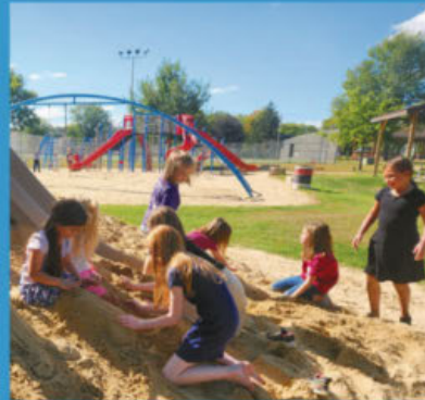
The 5th graders showed meekness when they put kindergarten and 1st grade students first during a trip to Jaycee Park. In the pictures to the left and below, the older students allowed the younger kids to choose what to play!

These last two weeks, our students focused on the virtues of courtesy and meeekness .