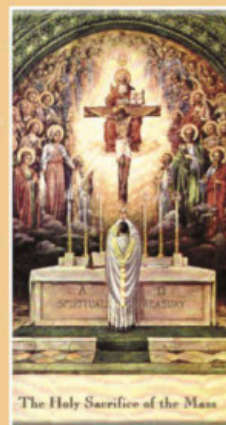
The Holy Sacrifice of the Mass Holy Mass 5:30PM