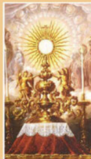
Adoration of the Blessed Sacrament 6:00 - 7:00PM