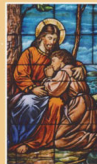
Confessions 6:00 - 7:00PM

The Mass is the moment when heaven and earth are united.