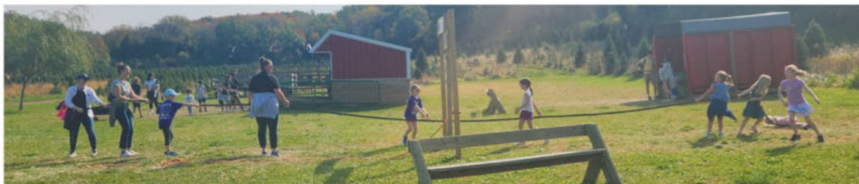
3rd and 2nd graders battle chaperones in an intense tug-a-war game!

It wouldn't be fall without our annual trip to the pumpkin patch! We were blessed with a beautiful day. Thank you to all the chaperones who were able to join us. It was a blast!